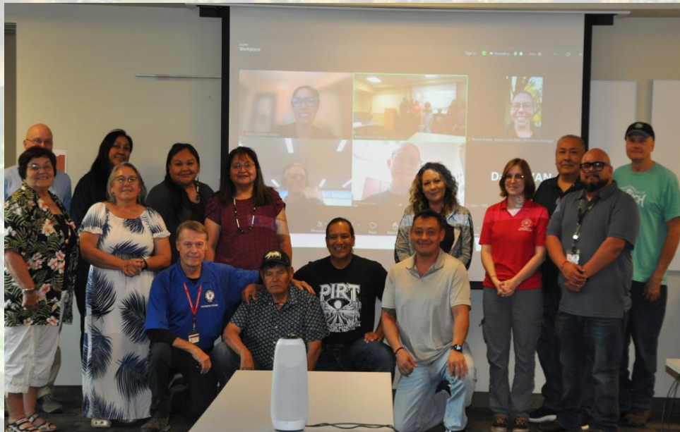
Fall 2025 in-person meeting at the Ak-Chin Indian Community