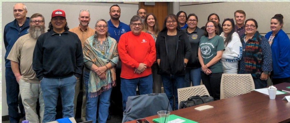
The Fall 2023 in-person meeting at the Choctaw Nation