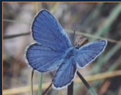
Karner Blue Butterfly