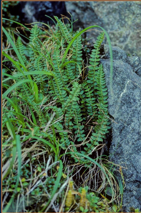
Aleutian Shield Fern