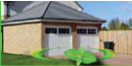
Garage & Attic