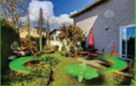
Back Yard & Patio